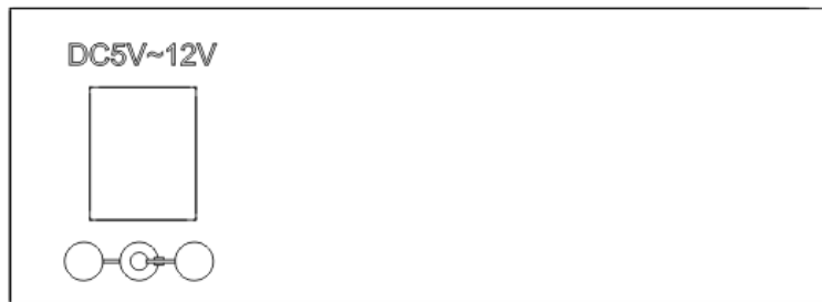
Fig.3 Rear panel